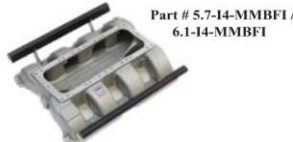
Part # 5.7-14-MMBFI / 6.1-14-MMBFI