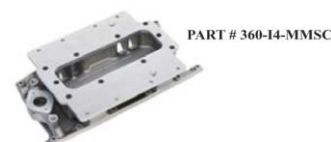
PART # 360-14-MMSC

Hemi is a trademark of Chrysler Corporation used for Identification purposes only.