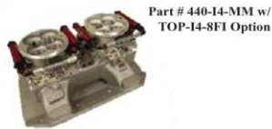
Part # 440-14-MM w/ TOP-14-8FI Option